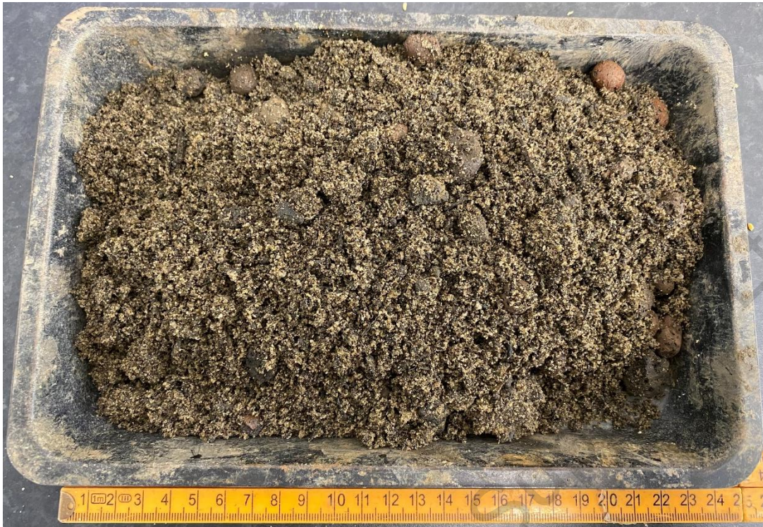
Plate 1: pH Neutral Lightweight Topsoil Sample